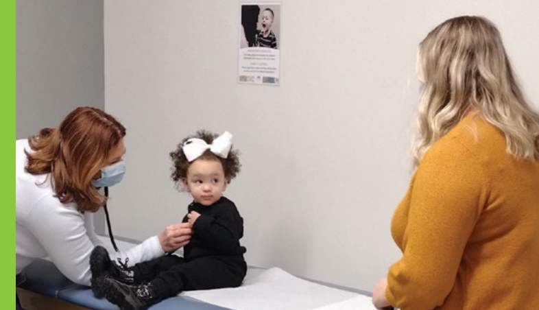
The HealthySteps program launched at Neighborhood Health Center Blasdell in 2022. HealthySteps promotes the health, wellbeing and school readiness of babies and toddlers, with an emphasis on families in low-income communities.

Unique patients experiencing homelessness.