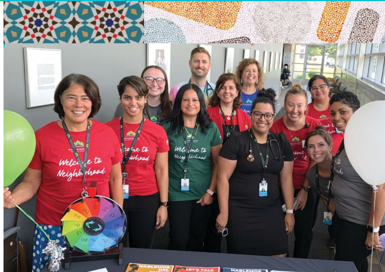
National Health Center Week festivities included Staff Appreciation Day and Patient Appreciation events at all Neighborhood sites.

55% of eligible patients were screened for colorectal cancer