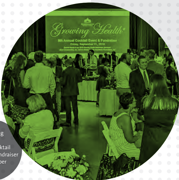
The Growing Health 8th Annual Cocktail Event & Fundraiser on September 21, 2018.

2018 clinical and operational performance has: